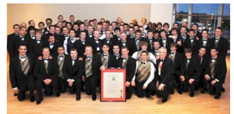
300 brothers, alumni and guests joined the celebration as Washington Alpha rechartered in April, 2009.